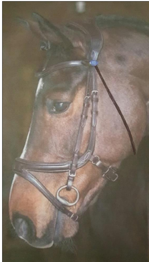
PS of Sweden Jump Off Bridle – 'Permitted' (must have a throat lash attached)