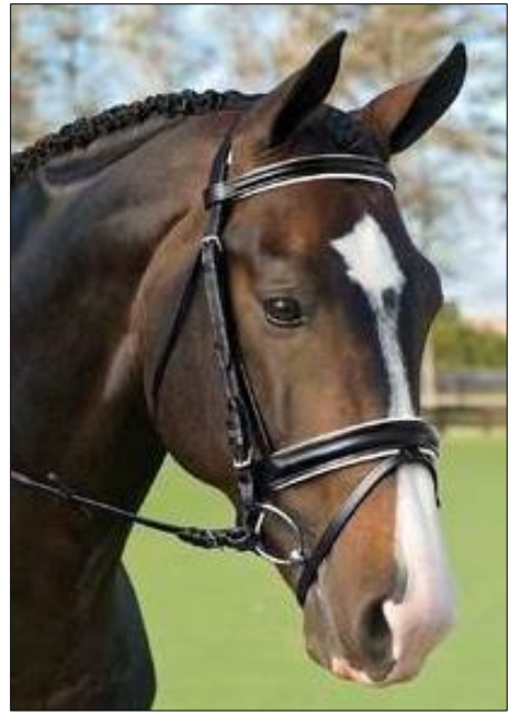
Cavesson with Flash Strap – 'Permitted'