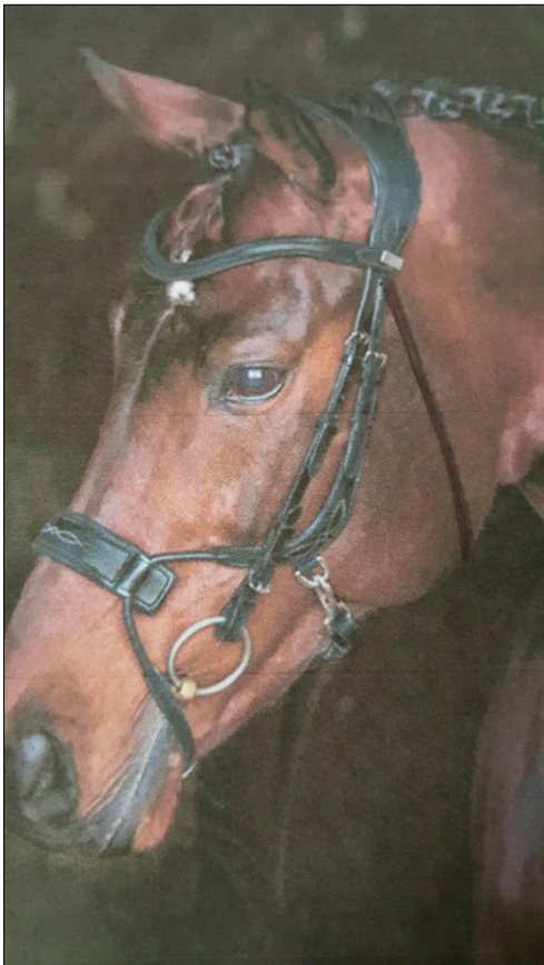
PS of Sweden High Jump Bridle – 'Permitted' (must have a throat lash attached)