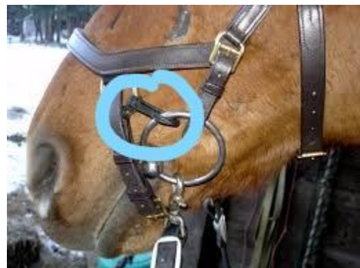
Micklem Bridle with clips – 'NOT Permitted'