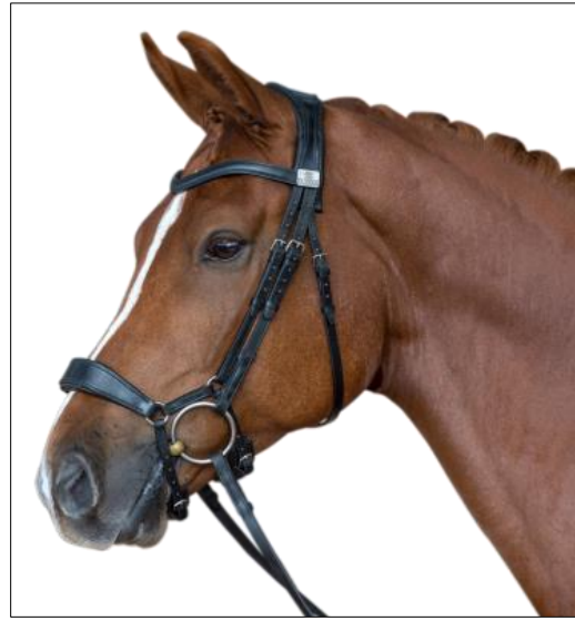
Fairfax Drop with Chin & Jaw Strap – 'Permitted'