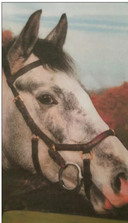
Micklem Bridle – 'Permitted'