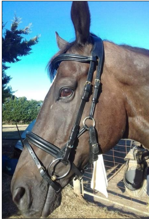
St Zaum Bridle – 'Permitted'