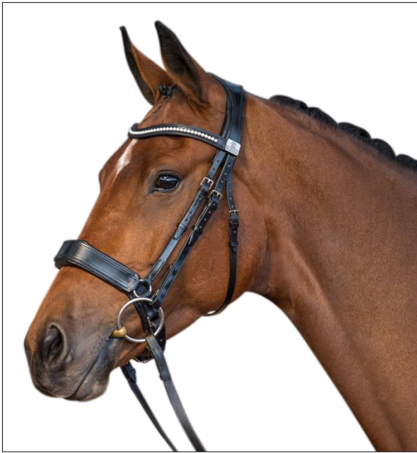
Cavesson Noseband – 'Permitted'