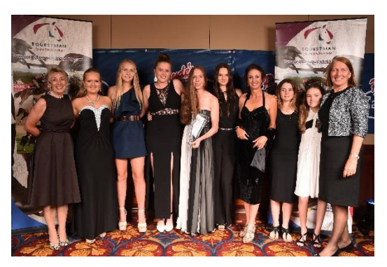
Interschool Queensland IQ Team of the Year Stuartholme School