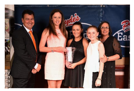
Interschool Qld School of the Year Fairholme College