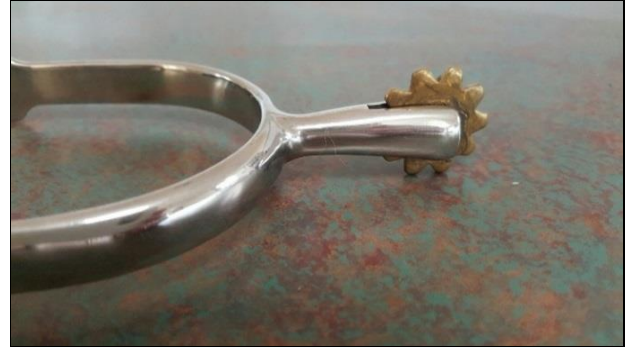
Blunt/smooth to touch rotating daisy rowel 'permitted'