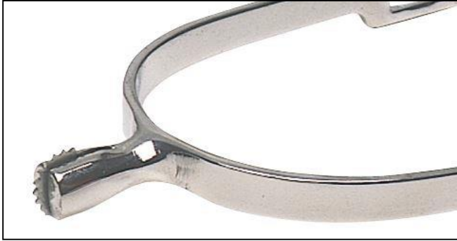
Small sharp segmented rowel 'not permitted'

Please note that the small sharp segmented rowel has been confirmed as 'not permitted' for any design of spur worn in dressage competitions