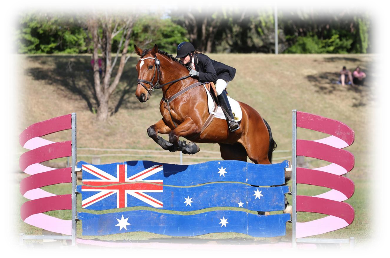
Mary Bates and Nandawar Makalu.

Entries open 1<sup>st</sup> December 2017 Entries close 24<sup>th</sup> January 2018 Stables must be booked by 14<sup>th</sup> January 2018 Height classes Friday 26<sup>th</sup> - enter on the day