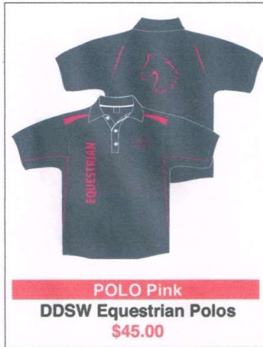
POLO Pink DDSW Equestrian Polos $45.00