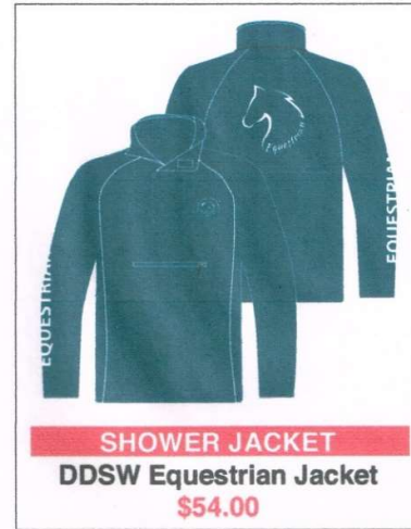
SHOWER JACKET DDSW Equestrian Jacket $54.00