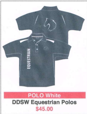
POLO White DDSW Equestrian Polos $45.00