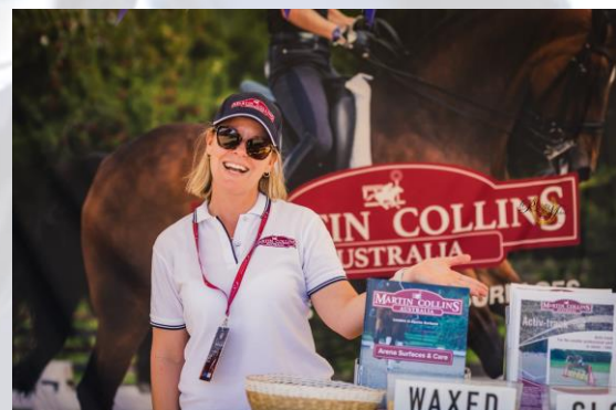
© Averil Crebbin – Picture the Moment 2021