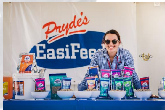
© Averil Crebbin – Picture the Moment 2021