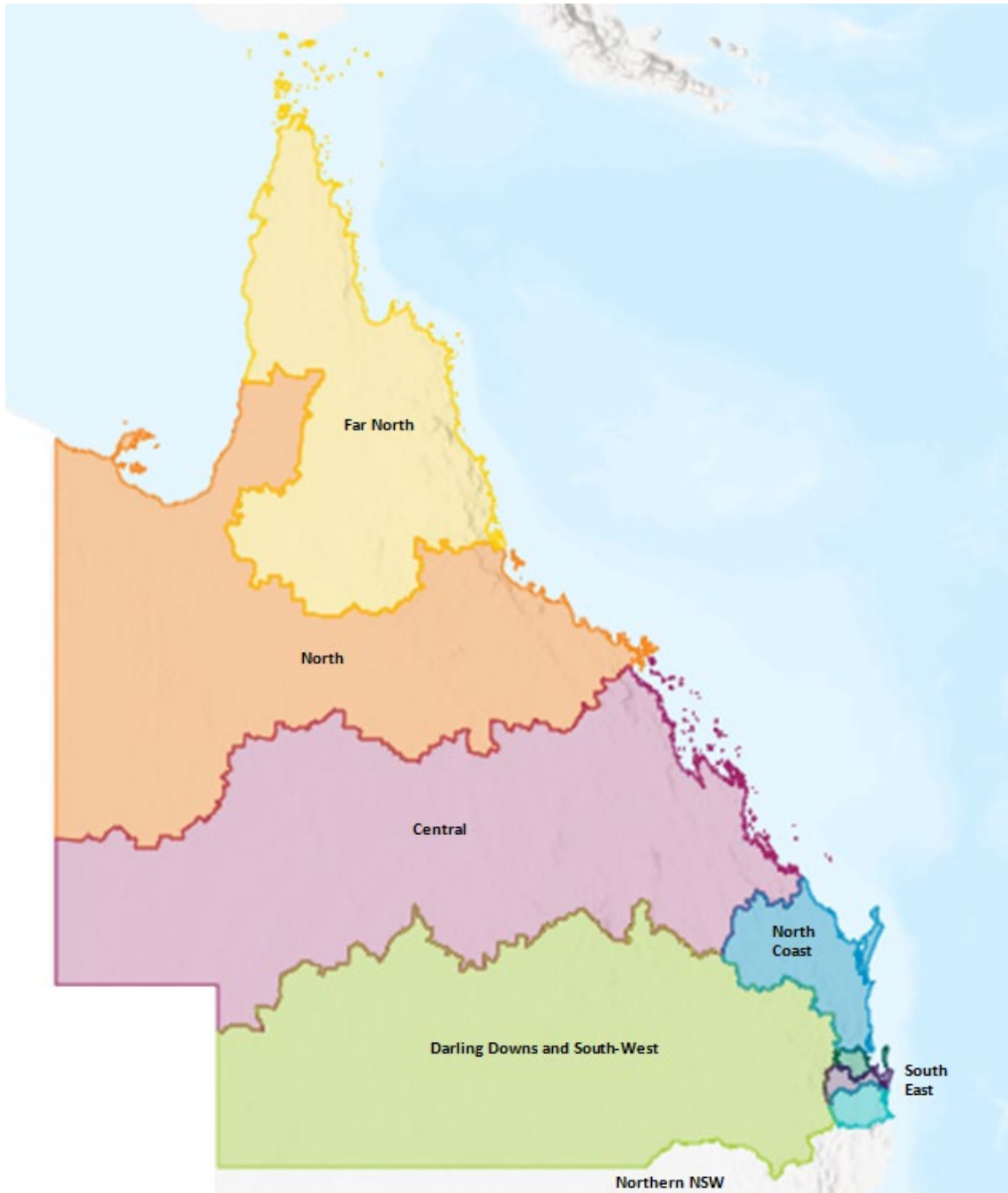
FIGURE I: MAP OF REGIONS