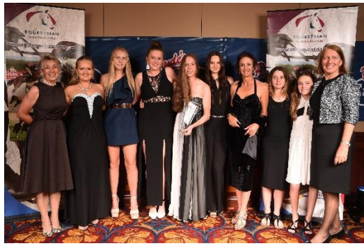
Interschool Queensland IQ Team of the Year Stuartholme School