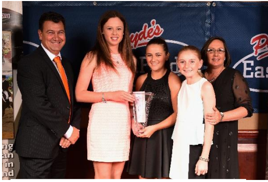
Interschool Qld School of the Year Fairholme College