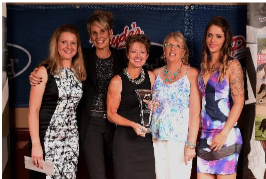
Aitken's Saddlery Event of the Year 2014 Festival of Dressage