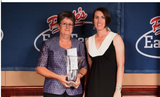
Equestrian Qld Club of the Year Warwick & District Carriage Driving Club Driving Club