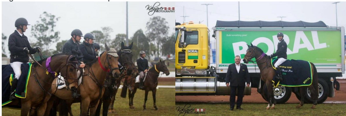
for the beautiful photo's

Congratulations to all the horses and riders.